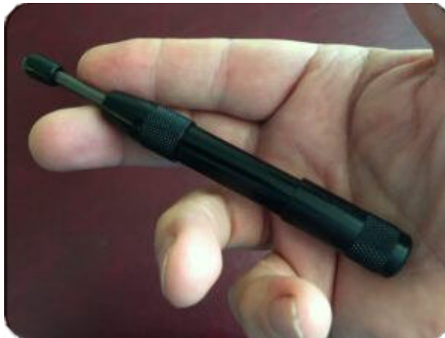
a NewStim Biokinetics™ instrument

Health Practitioners also get to treat themselves... of course! This is one of the best health choice you will ever do to yourself : Checking and treating literally any kind of health situation on a daily basis, and quickly see how your overall health is rising!